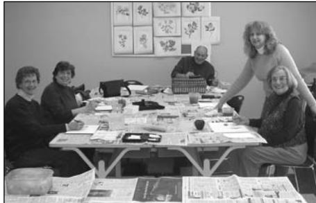
Art Class at the Mahwah Senior Activity Center

The Thimble Islands are located just off the shoreline town of Stony Creek, Connecticut and have often been described as a "piece of the Maine Coast" that drifted into Long Island Sound and came to rest at Stony Creek. Here you will have leisure time to browse the Thimble Islands and enjoy lunch at the Chowder Pot.