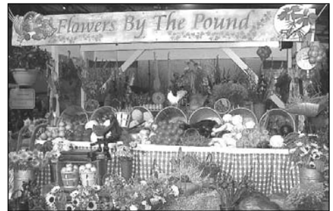
Senior Citizen's March Field Trip