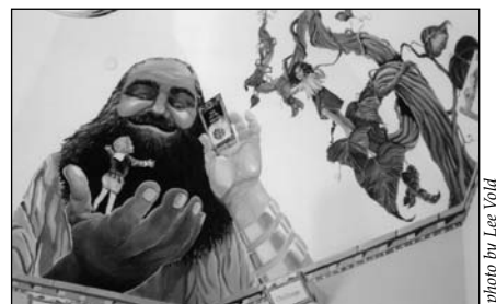
Children's Reading Tower Room Ceiling

Mahwah Public Library 100 Ridge Road, Mahwah NJ 07430 201-529-READ www.bccls.org/mahwah/