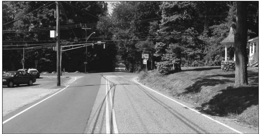
Forest Road looking west