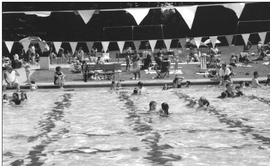
Cooling off in the Mahwah Pool