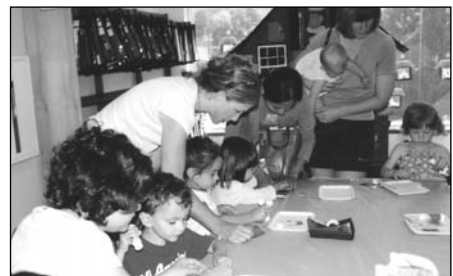
Children Painting in the Tower Room

In the Fall the library will return to regular Sunday concerts, regular children's Storytimes, and regular teen programming. To learn more about these and other programs visit or call the library at 201-529-READ or visit the website at www.bccls.org/mahwah/ .