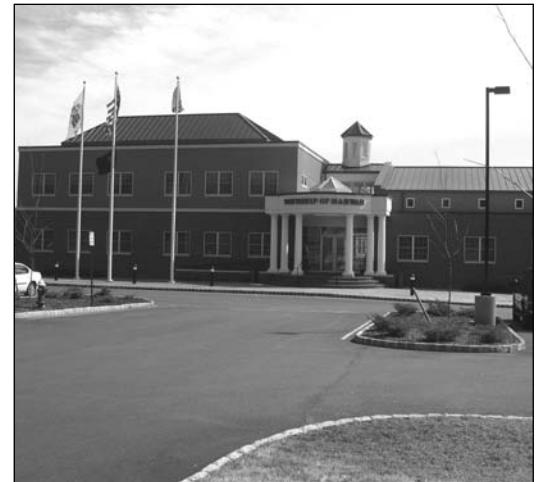
Mahwah Municipal Building

The Township Council, the legislative body of the community, has been very busy this year with the completion of Phase 4 sewers and the beginning of Phase 5. There have been road improvements throughout the Township, a new addition to and the updating of Fire Co. #1, the purchase of the property at Ridge Road and Macarthur Boulevard, as well as working tirelessly on committees such as recreation, transportation, and Township beautification. This year brings a new budget, new projects and mandates such as Storm Water Management, and compliance with the Highlands Act, which will involve active participation of the entire community. We look forward to a busy and rewarding year.