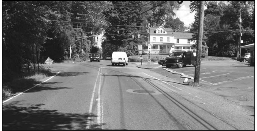
Wyckoff Avenue looking south

Colinelli Brothers Inc. has started construction activities for the Wyckoff Avenue and Forest Road Intersection Improvement Project. This work is a joint Bergen County and Township of Mahwah Project. The work is scheduled to continue through 2006. Work will be performed in sections so that the entire intersection will not be shut down. Partial road closures and detours will occur. The initial schedule will involve a closure of Wyckoff Avenue south of the intersection. Construction schedule updates can be obtained on the Township's website www.mahwahtwp.org , click on under Recent Updates - entitled Wyckoff Avenue and Forest Road Construction Update.