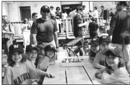
Youth Sports Spring Parade Kicks off Summer Recreation Season

gram is $10 per week. Registration forms for the MINI & BIG REC and C.I.T.s will be available after May 5, 2005 at the Recreation Building and the Municipal Building. Application forms for counselors will be available at the Recreation Building, Municipal Building, and Mahwah High School after April 18, 2005. For more information or questions, please call 201-529-1234. Please note that children entering grade 2 in September, 2005 will be part of the MINI REC program at Joyce Kilmer School.