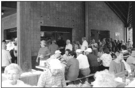
Seniors Picnic at Continental Soldiers Park

The Recreation Committee will host the 3rd annual Seniors Picnic at Continental Soldiers Park on Thursday, July 21st at 12:00 noon. This is open to all senior Township residents at no charge. Transportation can be provided by the Township's Access Transportation Program. If transportation is needed, please call 201-529-2691 to arrange.