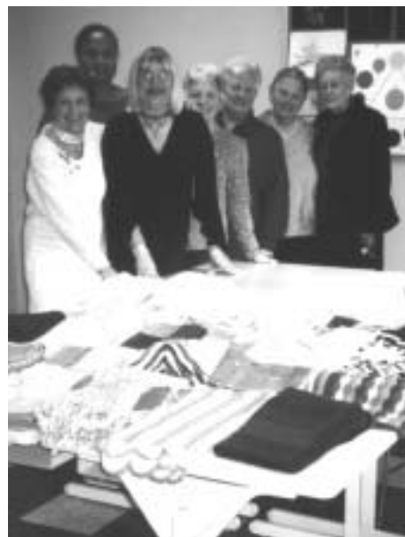
Sewing and Crafts Class at the Mahwah Senior Activity Center

The former home of Francis Du Pont, Winterthur is an American country estate nestled in the heart of Delaware's beautiful Brandywine Valley.