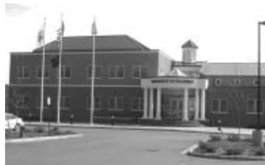
Mahwah Municipal Building