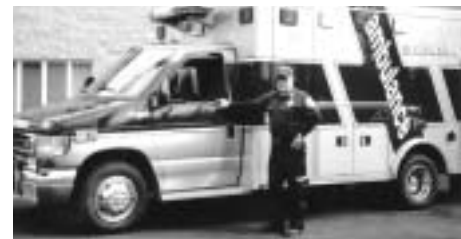
Captain Chuck Bethell Mahwah Ambulance Co. #4

If you have any questions, call us at 201/327-2252 or stop by our building any