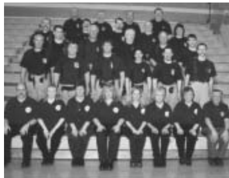
Mahwah Ambulance & Rescue Squad Co. #1 Pictured in the first row are E.M.T.'s (Emergency Medical Technician's), both active and retired. In the rows behind are firefighter drivers. See story on page 7.