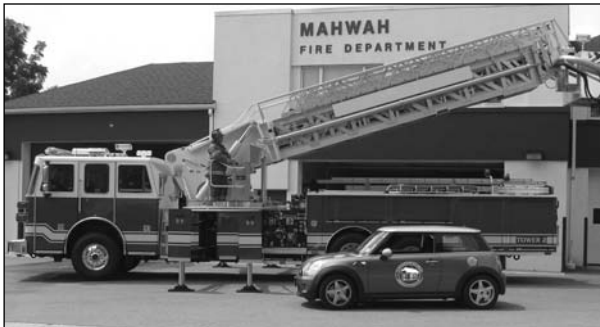
Township of Mahwah - No job too big - No job too small!!!

No job is too big or too small in the Township. In July 2009, Fire Company No. 2 received delivery of the new Fire Tower Truck. The truck was manufactured by the Sutphen Corporation. The vehicle replaces a 20 year old ladder truck which was a trade in. The truck has a boom, equipped with a bucket, total of 110 feet in length. The new and larger tower will help the Fire Department address an increased number of calls to larger homes that are set back from the road, commercial buildings and to the multi-level buildings at Ramapo College.