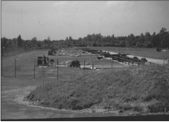
The launch base at the Nike Missile Base in Mahwah 1962

Until June 30, the Mahwah Museum is featuring “The Nike Base In Mahwah: Nuclear Warheads in our Backyard, a multimedia display about the base that was located off Campgaw Road.