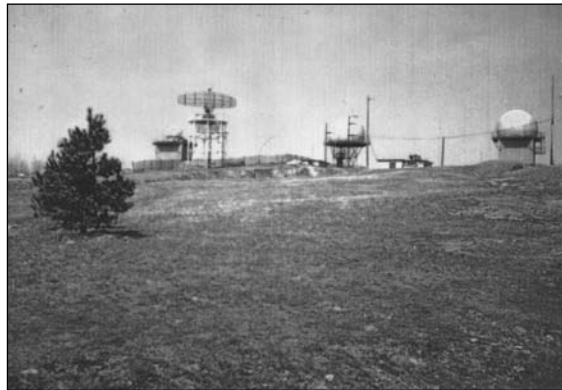
The Franklin Lakes Control Base in 1962

Nike missile bases were made obsolete very quickly by the development of the Intercontinental Ballistic Missile (ICBM) by both the United