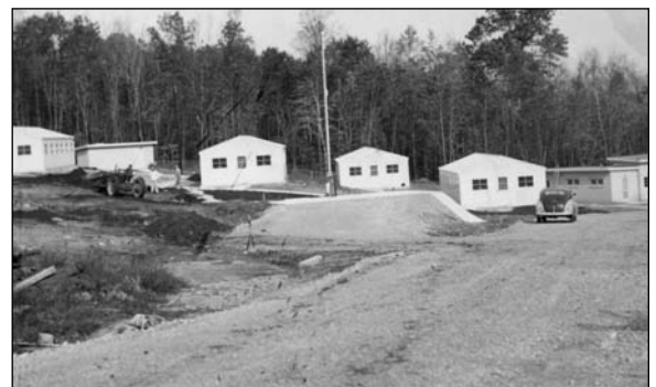
Nike Base Housing, Mahwah

Women on the Move: Tales of Bicycles, Bi-Planes and Big Cars ■