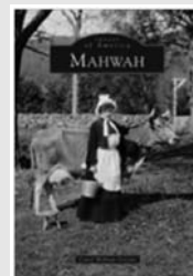
"Mahwah: Images of America"