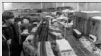
An enthusiastic visitor at the Donald Cooper Model Railroad

The expansion of the museum's spectacular Donald Cooper Model Railroad continues to entertain children of all ages. Children marvel at "Thomas the Tank Engine" as he makes his way around the modular scenery. Adults enjoy the detail of the subway as it winds its