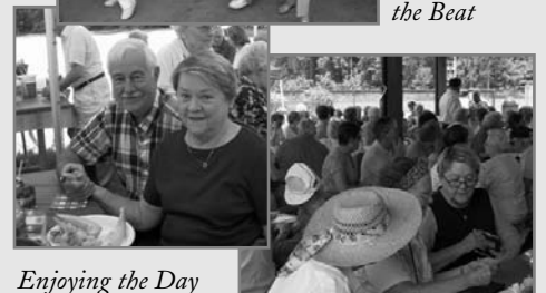
Enjoying the Day