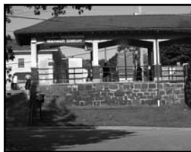
The Old Station Museum is Mahwah's first railroad station built in 1871. It sat next to the railroad just to the north of the present station. When it was in service, there was a grade crossing at this location. In 1904, the Erie Railroad expanded from two to four tracks and took the building out of service. At the same time the overpass was constructed, our present station was constructed in 1914 replacing another structure destroyed by fire.