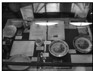
Collection of Erie Railroad china on loan from Jack Norris and other train artifacts will be on display for the remainder of the Old Station season, which ends in October.

The Old Station House and Caboose located at 1871 Old Station Lane are open each Sunday from 2 PM to 4 PM. Built in 1871 the Old Station House is a historic landmark and was the first railroad station in Mahwah. Our exhibits include a collection of Erie Railroad china from the dining cars of the long distance passenger trains, items from the Erie Centennial Train of 1951 and tools of the trade featuring lanterns, hat badges, locks, timetables, and tickets used by various railroad workers. Step into the station master's office and listen to the train engineers talking to each other. Next to the Old Station is the 1929 Caboose. The Caboose was the traveling office for the train crew and contained bunk beds, sink, desk and was originally lighted by oil lamps.