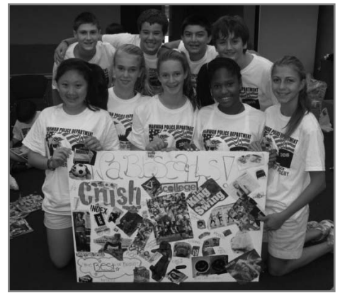
Students in the Leadership Academy display their work from a platoon competition that they participated in. Students later gave a presentation to the class on the work they completed.

self-esteem, team work, setting and attaining goals, and avoidance of peer pressure. Students attended classes to discuss what character traits make a good leader and participated in a number of team challenges throughout the one week Academy. This year a two night sleep-over in the College dorms highlighted the activities along with a trip to Philadelphia to see the historical