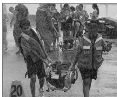
While at the Staten Island Coast Guard Installation students participated in a challenge designed to simulate actual situations members of the Coast Guard may encounter.

Liberty, and Ellis Island. This year was the largest enrollment ever with over 150 children in attendance and the graduation ceremonies were followed by a trip to a Newark Bears game and a fireworks presentation. A New Jersey National Guard Interdiction Helicopter also landed at the Ridge School and