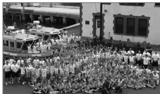
Team photograph of the 7th annual Junior Police Academy Class taken at the coast Guard facility next to two Coast Guard boats used to patrol the waters outside of New York City.

Honesty", and while the children enjoy the activities the goal of the Academy is to create bonds between the children and police officers, improve police com-