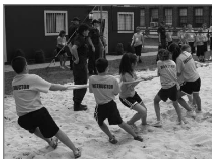
Student recruits participate in a team tug of war at the Staten Island Coast Guard Installation while officers from the Coast Guard and teammates cheer them on.

The Junior Police Academy is a two week event that is modeled after an actual Police Academy. The children learn and participate in a variety of activities during the academy. The two week Academy included morning physical