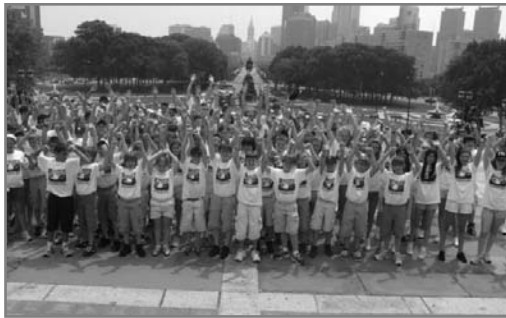
Leadership Academy students pose for their team photograph in Philadelphia where they visited several historic sites and climbed the stairs made famous in the "Rocky" movies.

The concept of the Leadership Academy was developed as a result of inquiries and requests from parents for a program to supplement the Junior Police Academy ideology for older children. The 2nd annual Leadership Academy was held at Ramapo College for students at the 7th, 8th, 9th and 10th grade levels. Over 130 students attended the Leadership Academy which is unique in its concept throughout the State. The students participate in a series of events with a goal towards building