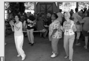
Getting With the Beat